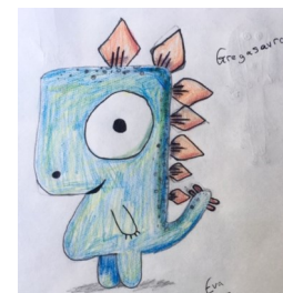
Eva sent in a drawing