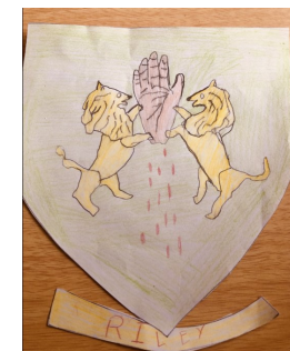
Jesse R's coat of arms

Woodthorne Road South, Tettenhall, Wolverhampton, WV6 8XL