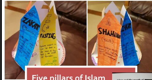
Five pillars of Islam